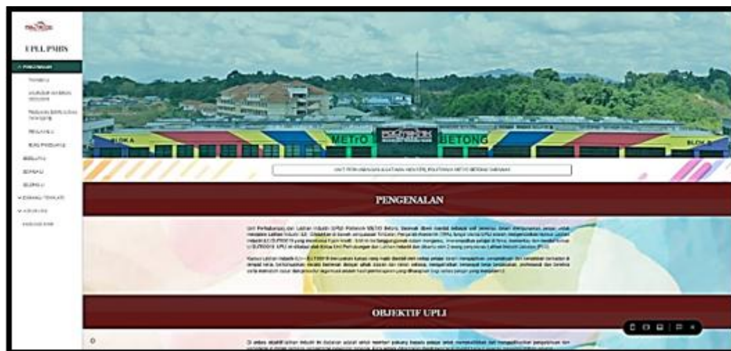
Fig. 3. Main page of PMBS UPLI Google site