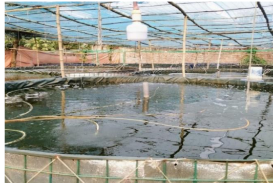
Fig. 2. Biofloc Technology in Aquaculture [16]

and actuator systems were created to discharge the right nutrition into the environment through a closed loop [25].