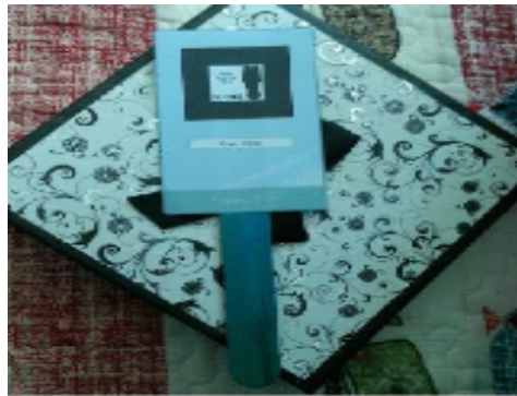
Fig. 4. Marker in the form of a paddle

A summative assessment based on the usability testing of the AR BACA-MV-SindD application was made based on the effectiveness construct of the application as evaluated by the elementary students. To determine the effectiveness of the AR BACA-MV-SindD educational application in the learning process, a pre-test-based semi-experimental research method, prior to the use of the AR BACA-MV-SindD application, and a post-test, after the use of the AR BACA-MV-SindD application, were implemented.