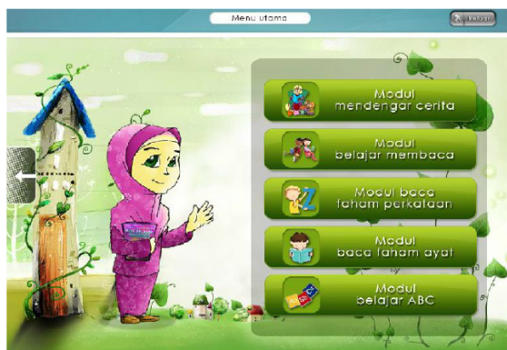
Fig. 1. Main menu

The learning environment produced through the use of AR technology is different from computer-based educational applications such as conventional multimedia. Therefore, to examine whether the developed educational application can meet the needs of elementary students with DS, a summative assessment through usability testing was implemented. An evaluation was conducted with one student with DS. The AR BACA-MV-SindD was developed after considering the needs and problems of this particular student. Usability testing was conducted to obtain feedback about the effectiveness of the courseware. Additional evaluations were performed with 14 more students with DS from Sekolah Kebangsaan Jalan 6, Bandar Baru Bangi, Selangor. All students had limited reading skills with mild intellectual disabilities.