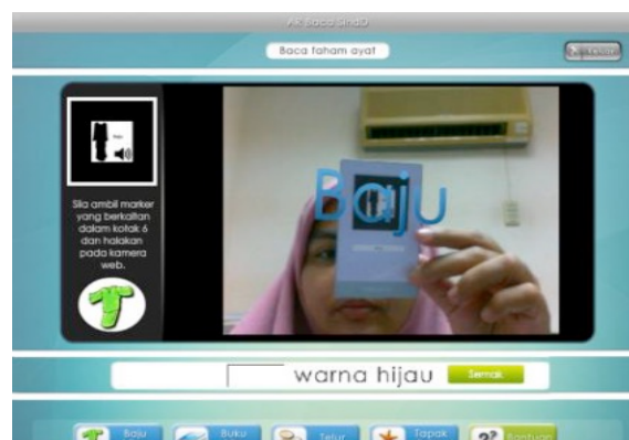
Fig. 3. Module of Baca Faham Perkataan