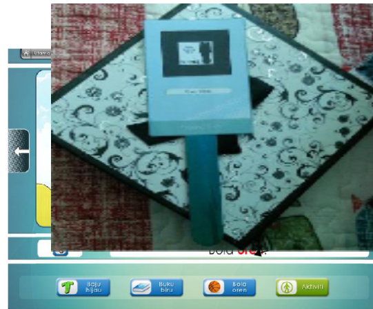
Fig. 2. Module of Belajar Membaca