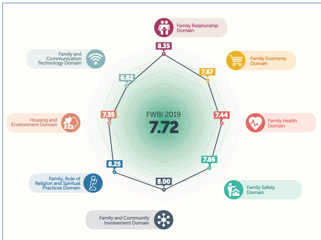
Fig. 1. Malaysia Family Well-being Index 2019

in family well-being. The scores varied by state, with Putrajaya recording the highest and Perak the lowest.